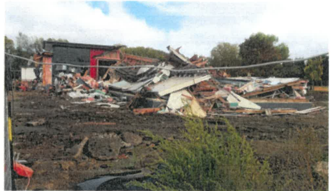
The Senior Learning Centre demolition