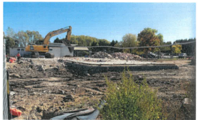
Below: Admin Block progression