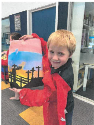
Wonderful ANZAC Day art created by the students in Room 4